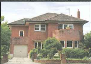
Waterfall (Art Deco) Homes