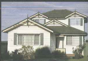
Suburban Weatherboard Home