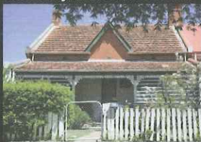
Colonial Pyramid Semi-Detached